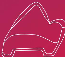
Lateral view – BonSelect TCR