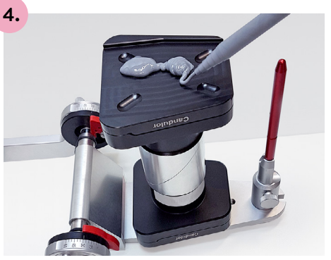
Invert the centring key together with the calibration base plate in the articulator and apply metal glue to the center of the plate.

The base plate will be fixed in the upper part of the Candulor plate magnetically, supported by the metal glue. Allow the adhesive to cure for at least 90 min. Only then glue the lower plate.