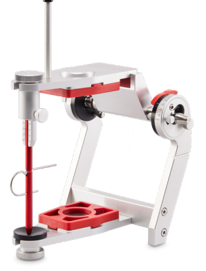
759233 - Articulator CA 3.0 LARGE