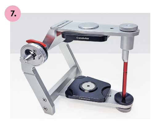
Calibrated CA 3.0 LARGE articulator inclusive plate set for Splitex ^{\oplus} with a height of 126 mm.

Fix the articulator in place using a rubber band and let the adhesive cure for approx. 90 min.