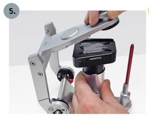
Close the articulator (still upside down).