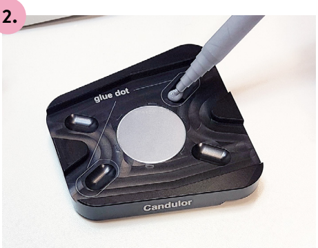
Fill metal glue in the recesses of the base plate marked with "glue dot" and open the articulator, turning it upside-down.

CA 3.0 LARGE is ready for gluing the plate set for Splitex ^{\otimes} and for its calibration. The red model plates need to be removed upfront.